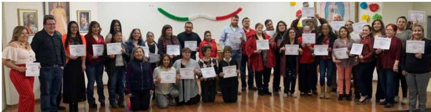
Graduation: Part of the students of Citizenship Preparation Classes. February 2020